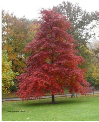
BLACKGUM IN FALL