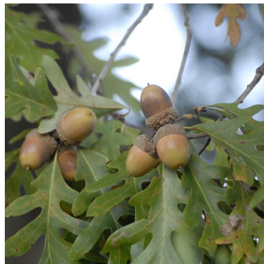
WHITE OAK ACORNS