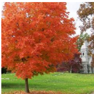
LEGACY SUGAR MAPLE

Shallow, spreading root system needs ample growth space away from sidewalks and driveways