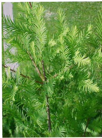
BALD CYPRESS FOLIAGE