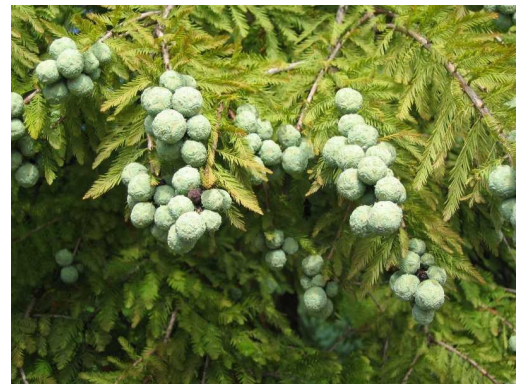
BALD CYPRESS CONES