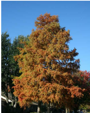
BALD CYPRESS IN AUTUMN

Great canopy tree for tighter spaces; roots will not buckle pavement