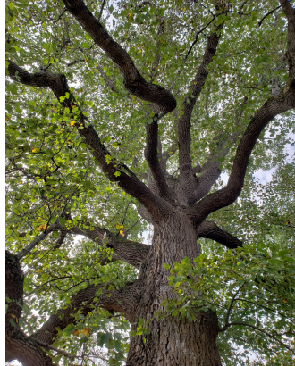
BEAUTIFUL BRANCHING STRUCTURE