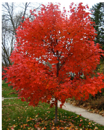
AUTUMN BLAZE RED MAPLE