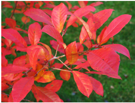
BLACKGUM FALL LEAVES

Provides excellent nutrition for bees in early spring