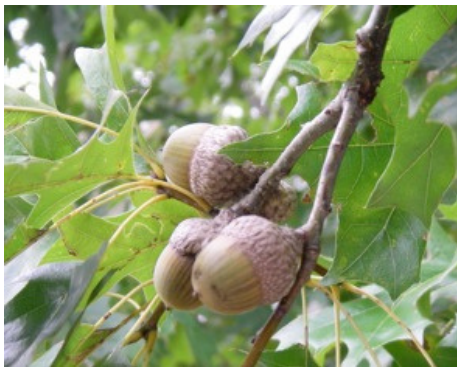
NUTTALL OAK ACORNS

Outstanding canopy tree; excellent habitat for birds and other wildlife