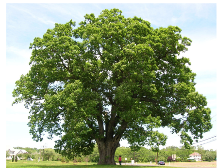
MATURE WHITE OAK