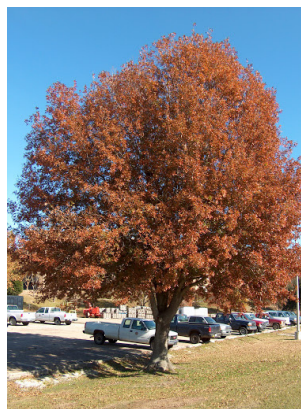
MATURE NUTTALL OAK