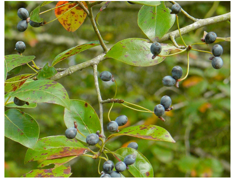
LEAVES AND BERRIES IN SUMMER