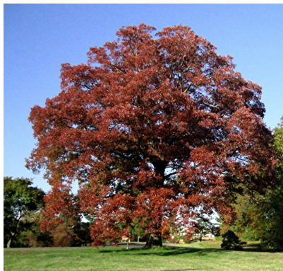
WHITE OAK FALL COLOR

Beautiful fall color and excellent habitat for a wide variety of fauna (including bats!)