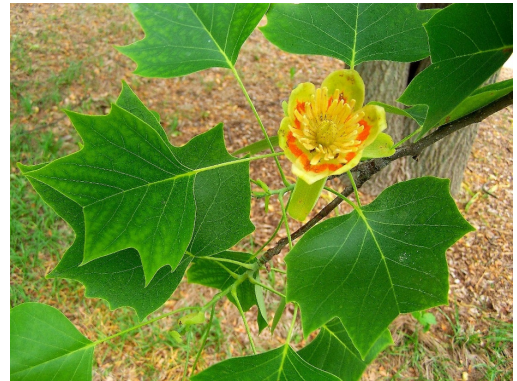
TULIP POPLAR LEAVES AND BLOOM