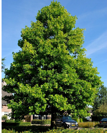
MATURE TULIP POPLAR

Cat-shaped leaves are bright green; blooms in early summer